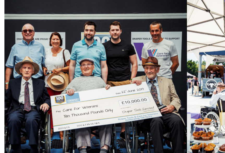
We're a family business and we respect the contribution of previous generations...