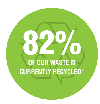
*January - July 2021

We're committed to reduce. reuse and recycle.