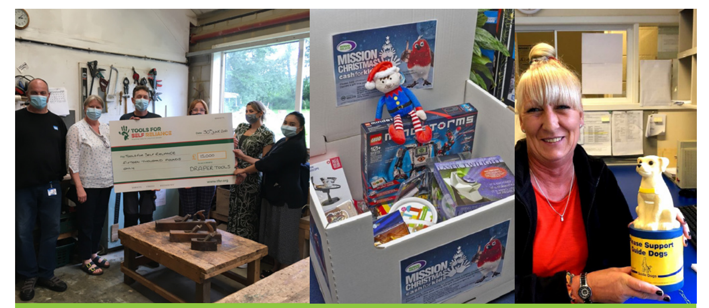
Tools for Self-Reliance: we support their people-centred approach to development assistance...