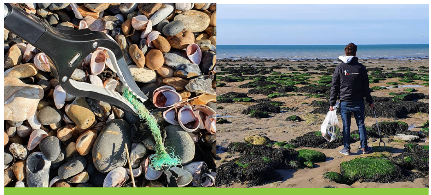
...and we are helping to turn the tide on plastic waste.