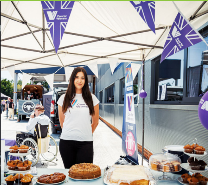
...so we are proud to support charities like "Care for Veterans"